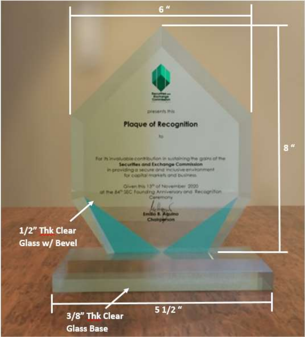
ITEM 1: SEC AWARDEES