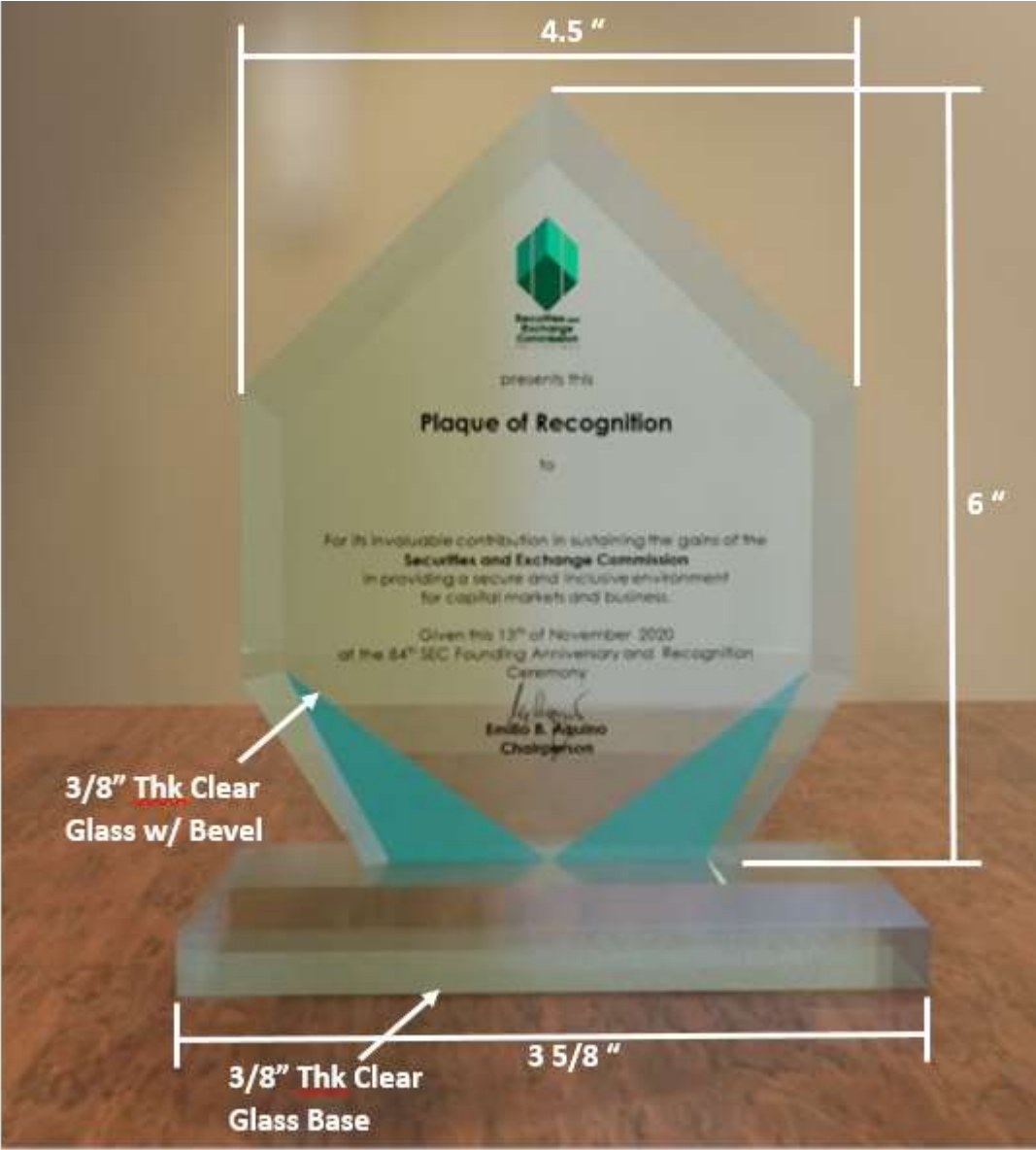
ITEM 2: SEC AWARDEES FOR SEC EXTENSION OFFICE